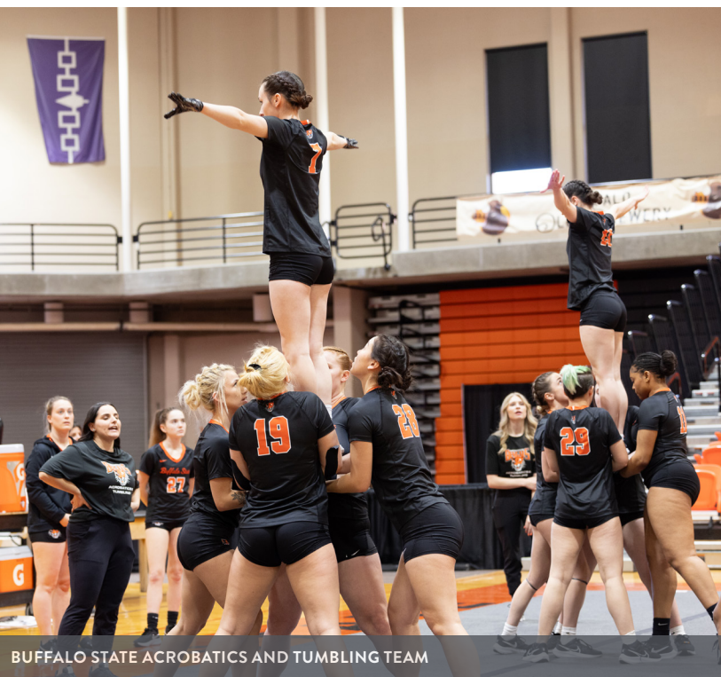
BUFFALO STATE AEROBATICS AND TUMBLING TEAM