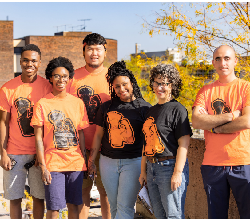
THE ANNE FRANK PROJECT