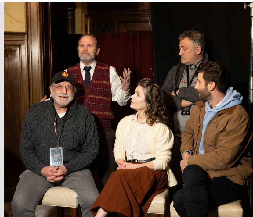
FILMING OF 'THE WRONG ROAD'