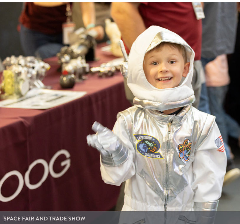
SPACE FAIR AND TRADE SHOW