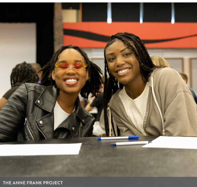
THE ANNE FRANK PROJECT