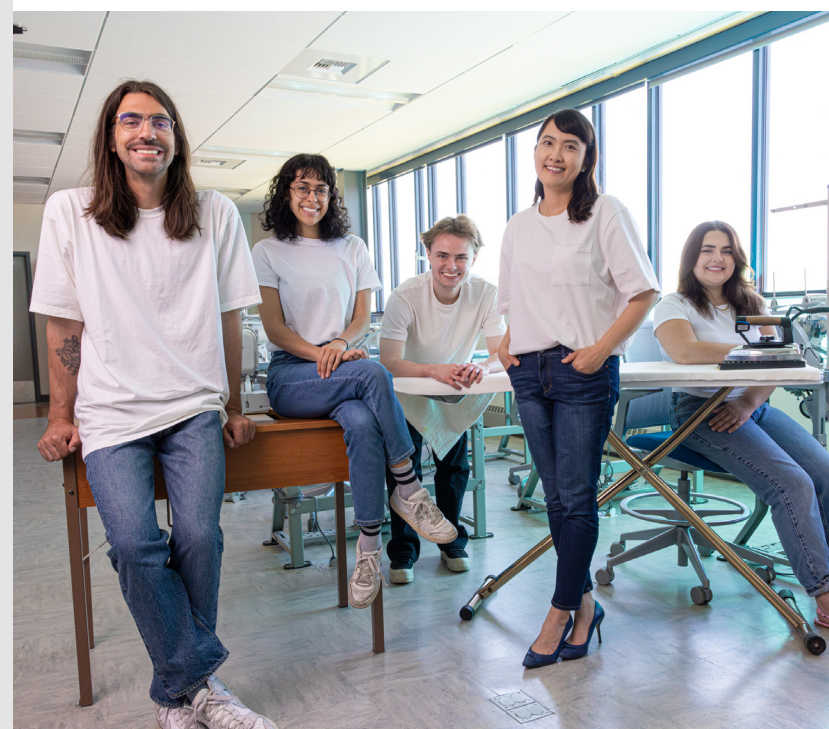
FASHION AND TEXTILE TECHNOLOGY DEPARTMENT