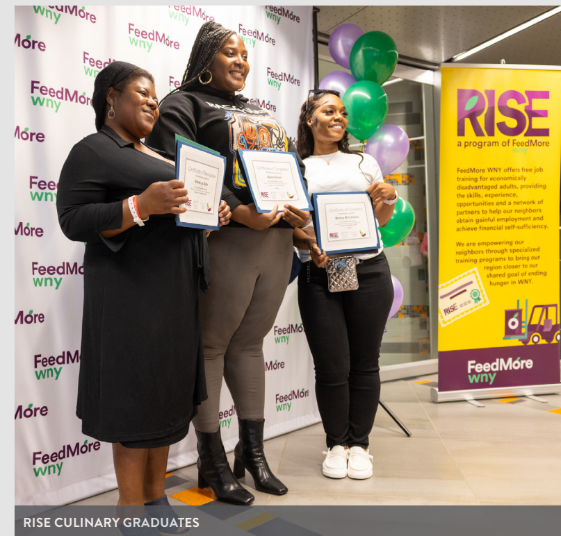
RISE CULINARY GRADUATES

Hall. The 14-week course (including a two-week internship) offers adults hands-on experience in a commercial kitchen. Students earn certification in ServSafe food handling, administered by the National Restaurant Association, as well as Certified Fundamentals Cook certification from the American Culinary Federation. Additionally, RISE, which is geared toward individuals with high barriers to employment, allows participants to develop skills like résumé writing, financial literacy, and interview preparation. Wraparound services such as transportation assistance, child care, daily meals, and food pantry access are also provided.