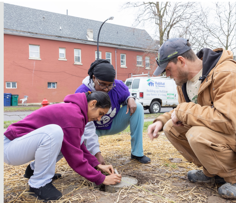
ALTERNATIVE SPRING BREAK

Runway, Buffalo State University’s Fashion and Textile Technology Department’s annual student-produced fashion show, presented by New Era Cap, returned on April 20 with the theme “True Delusion,” which explored the layers and facets of mental health. Since its debut in 2008, Runway has provided students with a professional venue to showcase their talents. In addition to the onstage display of student designs, students are responsible for marketing, creative direction, logistics, and stylistic choices for the event. This year’s show featured 11 senior designers and 110 models, along with many other student designers and participants. Runway 2024 sponsors include the mental health organizations Better Mynd, Crisis Services, and Evergreen Health.