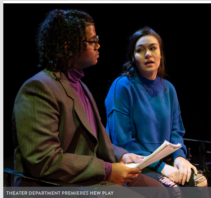
THEATER DEPARTMENT PREMIERES NEW PLAY