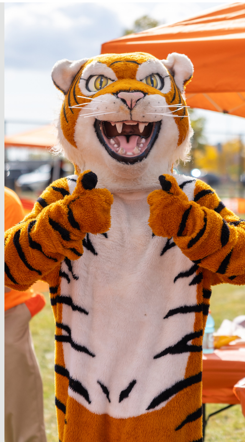
ALUMNI CELEBRATE HOMECOMING

In May, Buffalo State provided an opportunity for 2020 alumni to reunite, celebrate, and enjoy memorable moments they couldn’t share four years ago. Throughout the COVID-19 pandemic, Buffalo State University maintained its commitment to the safety of students, faculty, and staff, which meant many difficult decisions—like the postponement of 2020 Commencement ceremonies and the move to hold them virtually the following September. This year, alumni from the Class of 2020 had the chance to reunite and celebrate their accomplishments on May 24–25, through multiple events, including school-specific receptions that gave 2020 alumni the chance to reconnect with deans, chairs, and professors.