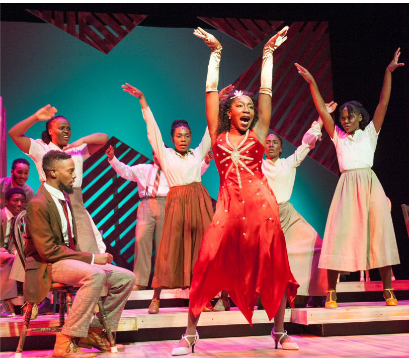
THE COLOR PURPLE