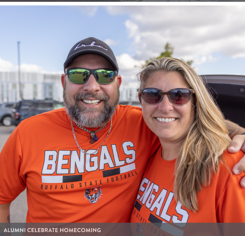
ALUMNI CELEBRATE HOMECOMING