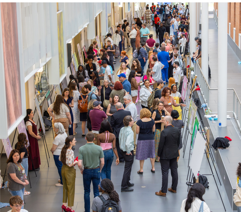
STUDENT RESEARCH AND CREATIVITY CONFERENCE (SRCC)