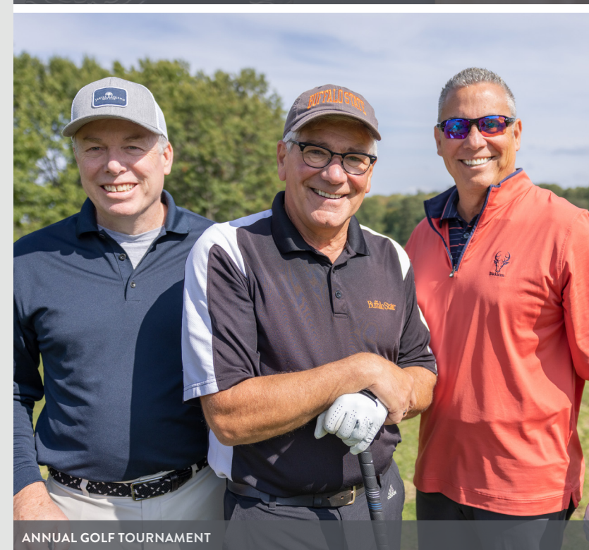
ANNUAL GOLF TOURNAMENT