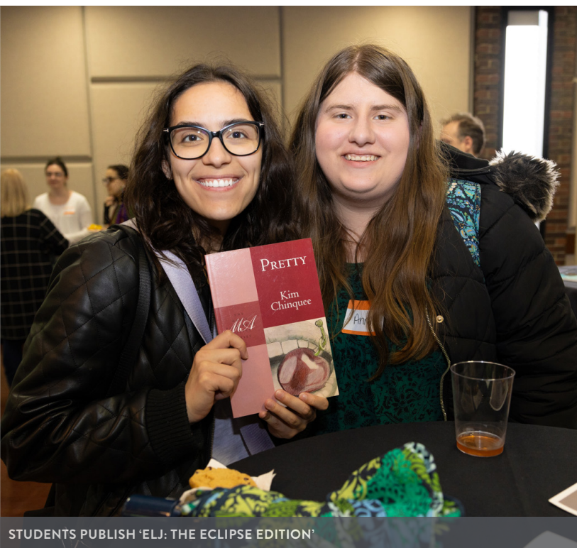
STUDENTS PUBLISH 'ELJ: THE ECLIPSE EDITION'