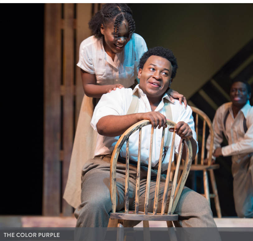
THE COLOR PURPLE