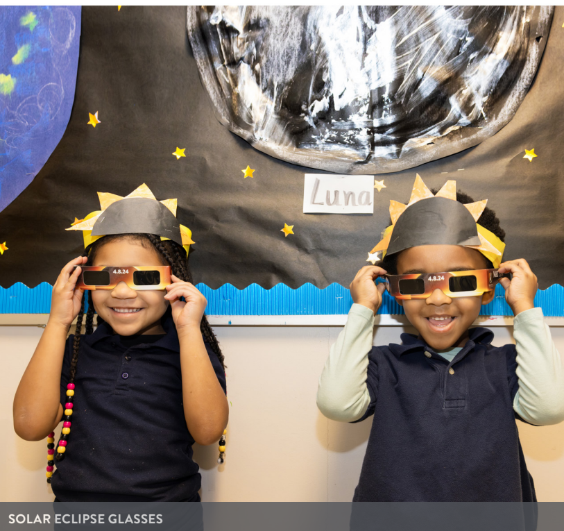
SOLAR ECLIPSE GLASSES

Mathematics Complex before receiving training from the Buffalo Astronomical Association and learning about the night sky at the Whitworth Ferguson Planetarium. The event on February 19 concluded with students using the telescopes outside for the first time at nightfall. The program is part of the Science Haven's Stellar Dreams initiative.