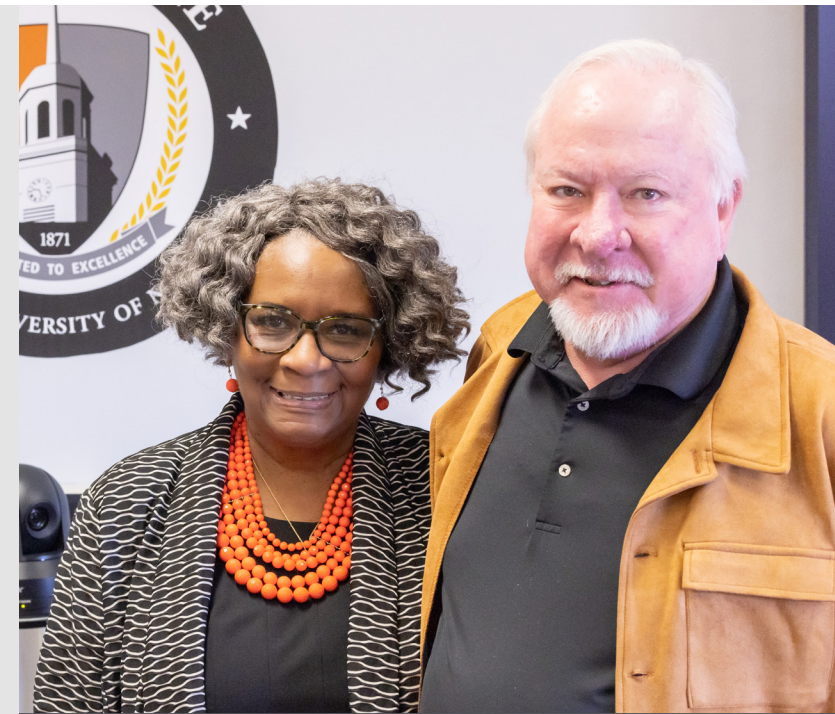
DEDICATION OF GLOBAL LEARNING LAB