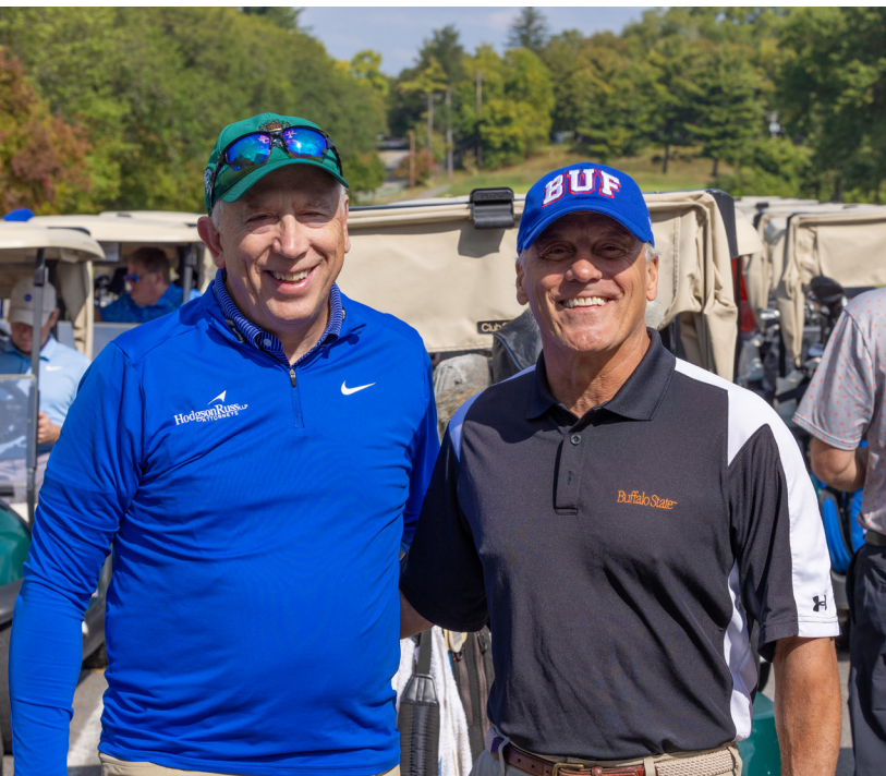
ANNUAL GOLF TOURNAMENT