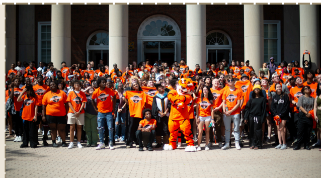
CLASS OF 2028 PHOTO

Homecoming events that celebrated students' strength, unity and connection to Buffalo State.